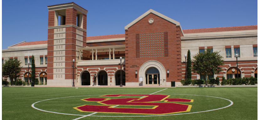
John McKay Center